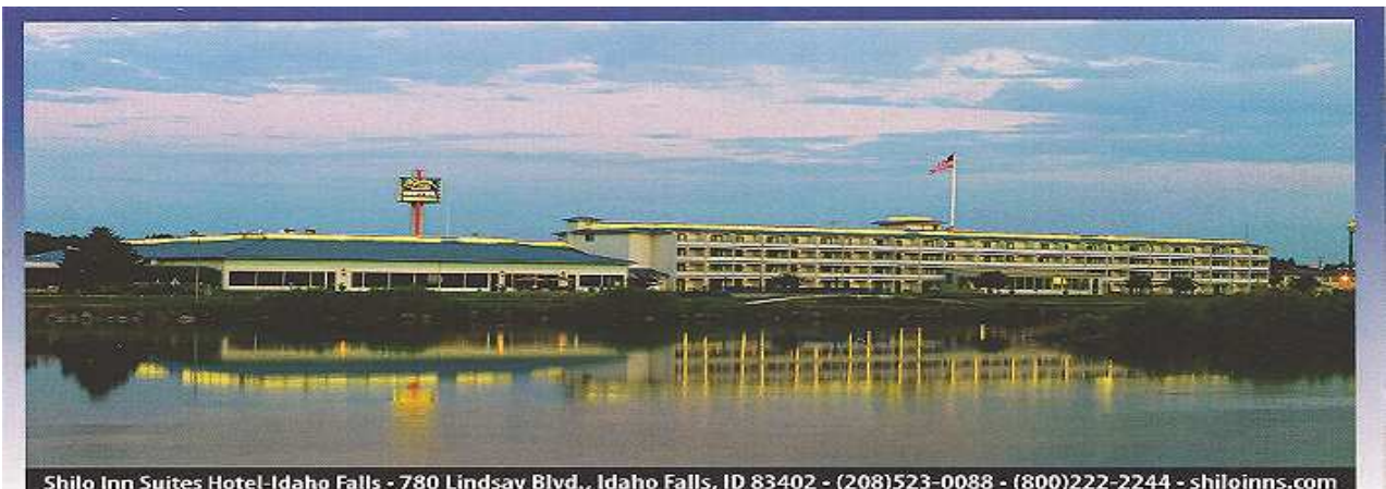
Shilo Inn Suites Hotel-Idaho Falls - 780 Lindsay Blvd., Idaho Falls, ID 83402 - (208)523-0088 - (800)222-2244 - shiloinns.com

Idaho Falls is an Antiquer's dream. Visit over 10 antique shops. The Museum of Idaho, located very close to the Shilo Inn, offers traveling and permanent displays. The traveling display available to us in October is Lincoln: Preservation of a Nation – "Abraham Lincoln: the influential leader who altered the